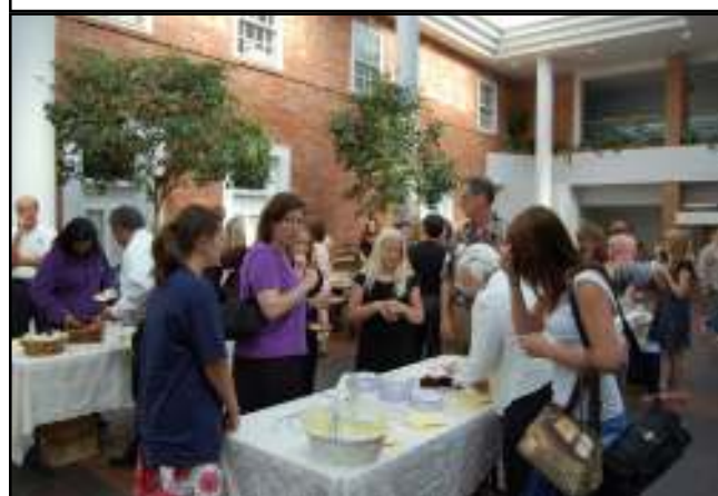
The site of the reception was the beautiful interior courtyard of the Westminster Presbyterian Church.