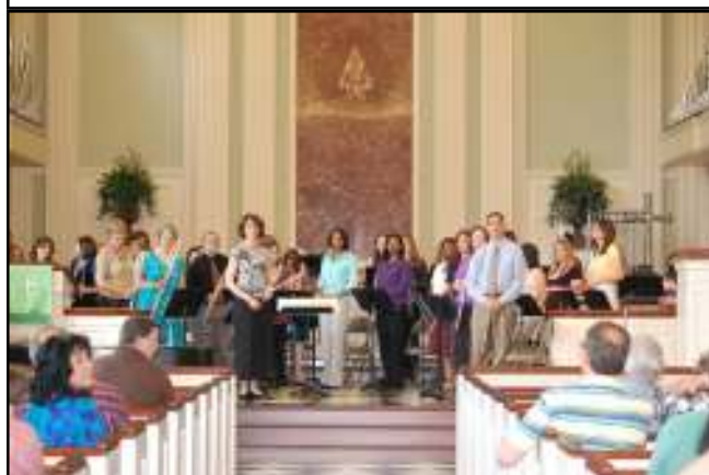
The combined flute choirs in their final numbers.