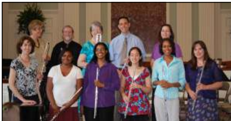
The OFS Adult Flute Ensemble