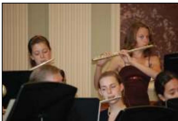
Flutists in action during the final combined flute choir numbers.